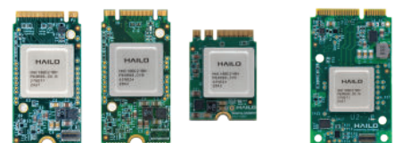
Hailo-8™ M.2 Key M B+M A+E

Modules enable fast time to market & easy HW integration