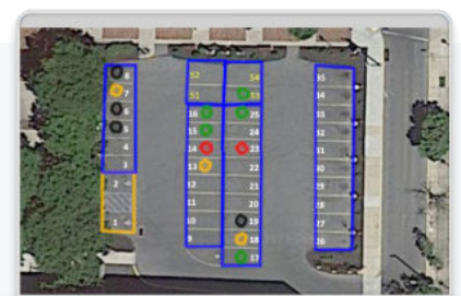
Sample Site Operational UI, USA

Seamless integration through comprehensive documentation and open communication