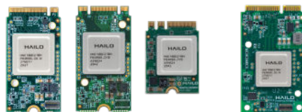
Hailo-8 M.2 Key M B+M A+E Hailo-8R mPCIe

Modules enable fast time to market & easy HW integration