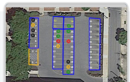
Sample Site Operational UI, USA

Seamless integration through comprehensive documentation and open communication